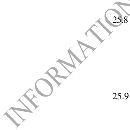
26. Liquidated Damages